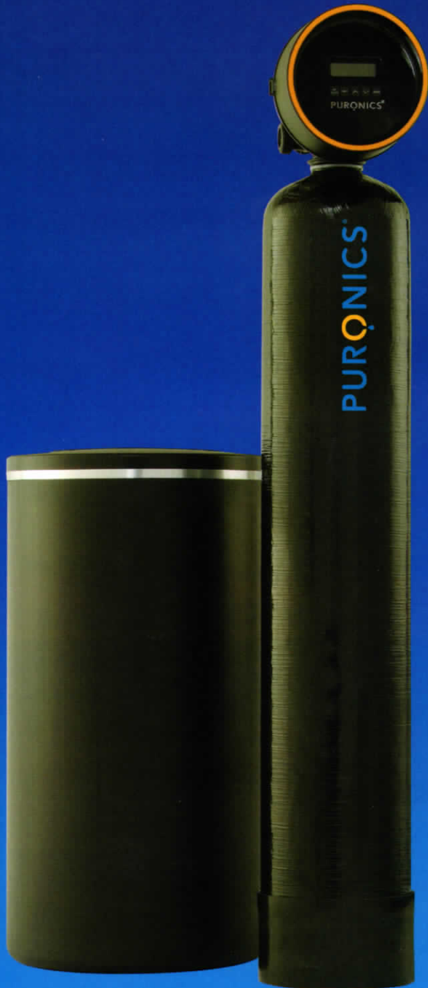
Hair and skin are soft and silky

The Puronics® Defender™ iGen® whole-house water conditioner provides budget minded families with the most technologically advanced equipment available today. The sophisticated digital control valve monitors your water usage so you don't have to. It will alert you when it is time to change the filter media, ensuring you always have the highest quality water at the lowest cost. Your family will enjoy the benefits of our advanced SilverShield® Protection conditioned water in a durable, cost-effective package for years to come.