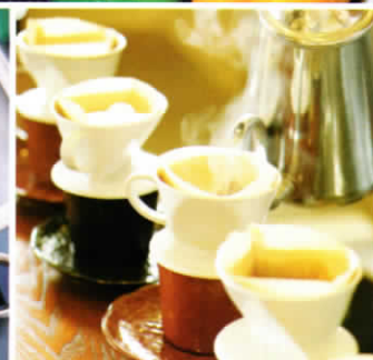
Better tasting beverages