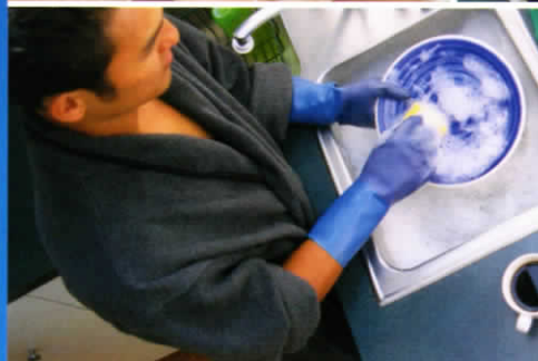
Dishes are cleaner