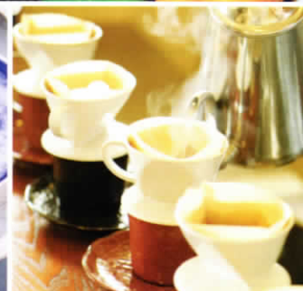
Better tasting beverages