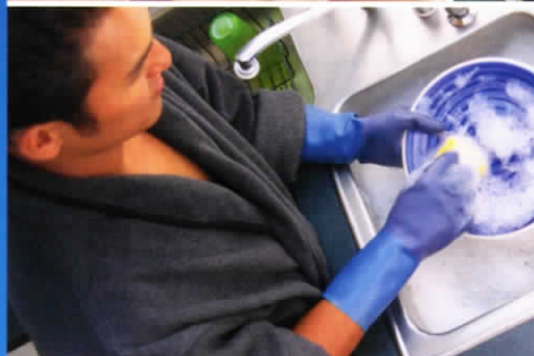
Dishes are cleaner